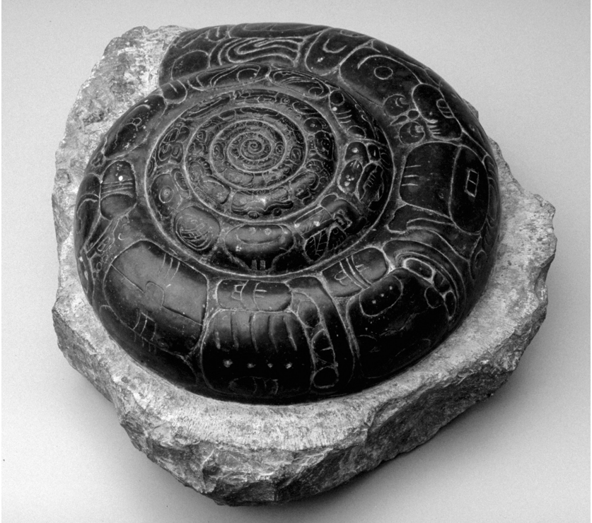
Tom Chapin, Sky Burial , 1997. Marble, 26" x 24" x 12". Photo: Tom Chapin.